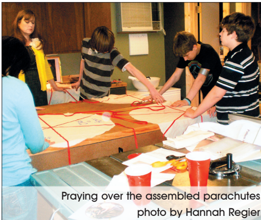
Praying over the assembled parachutes

On Missions Sunday, Redeemer’s youth group assembled ten parachutes for Voice of the Martyrs.